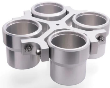
BRK5520 ROTOR (4*500ml)